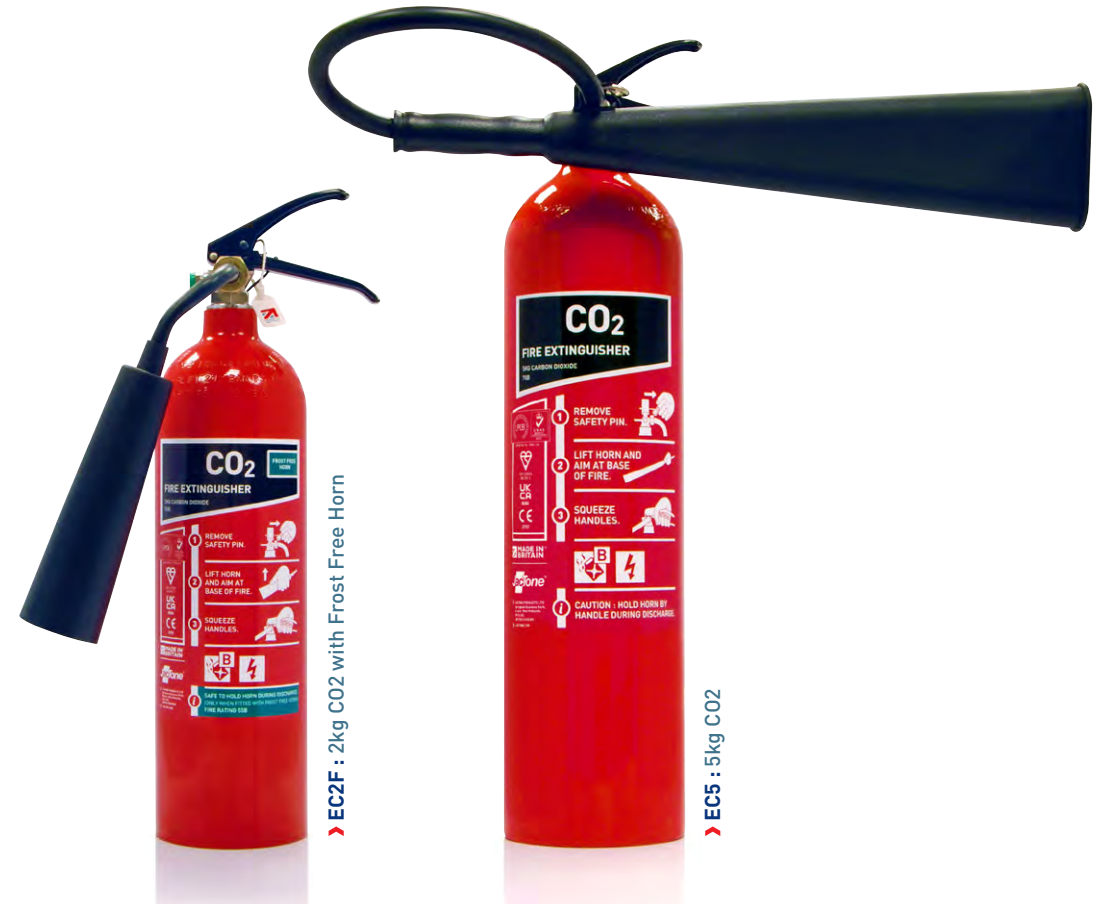
› EC2F : 2kg CO2 with Frost Free Horn