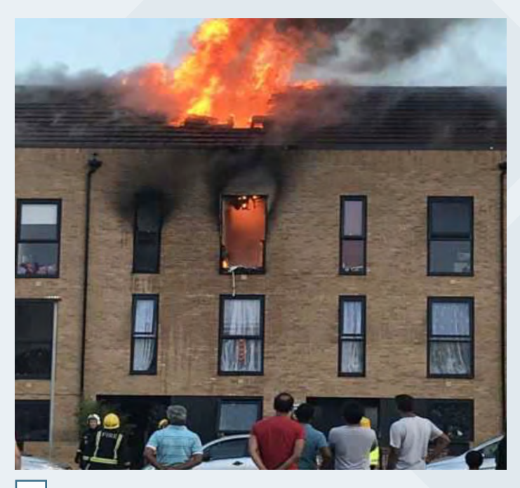
1 Mid terrace house fire

London Fire Brigade, PVSTOP Global Pioneer deployed at terrace house.