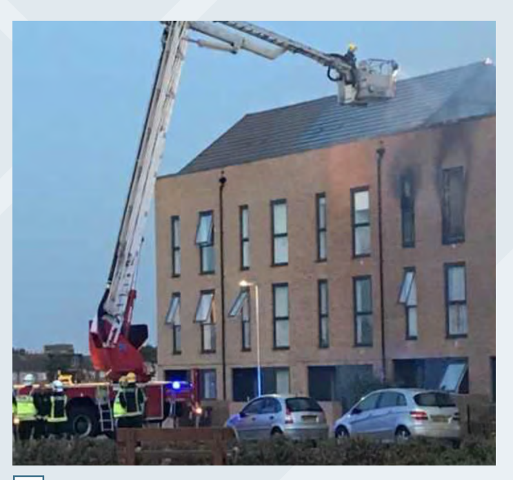
Presence of solar panels identified

In July 2018, PVSTOP was requested for an incident at a terrace property. Fire crews attending the fire in Dagenham identified the presence of solar panels on the roof of a mid-terraced house and an aerial appliance from Tottenham attended.