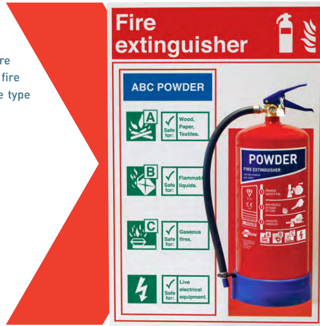
› 50135F : ABC Powder