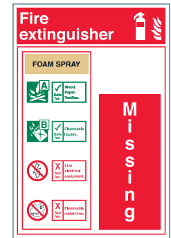
› 50134F : Foam