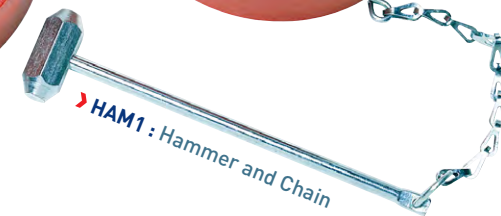
› HAM1 : Hammer and Chain