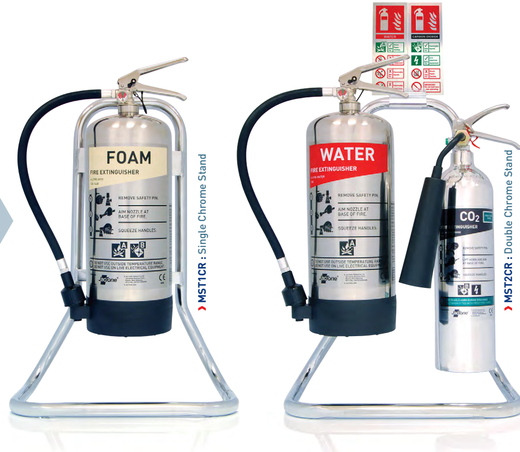
› MST1CR : Single Chrome Stand