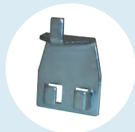
› BF007 : Adaptor Bracket