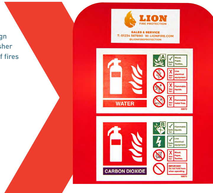
› SBS1 : Sign Board