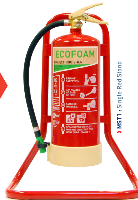
› MST1 : Single Red Stand