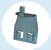
› BF007 : Adaptor Bracket