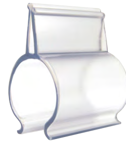
› SSC2 : Sign Clip