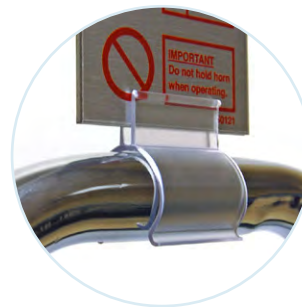
Clips onto tubular metal stand