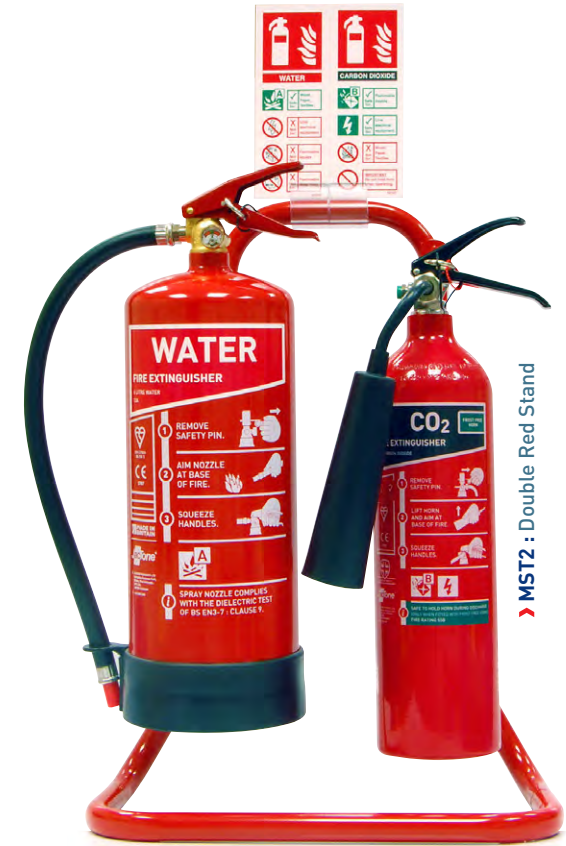
› MST2 : Double Red Stand