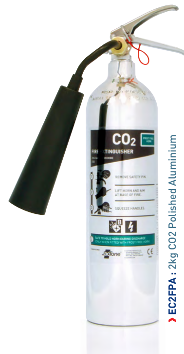
› EC2FPA : 2kg CO2 Polished Aluminium