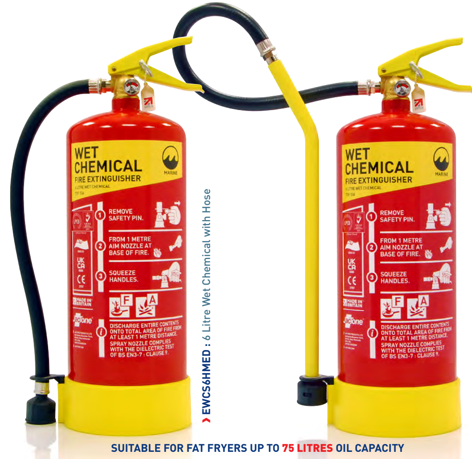
› EWCS6HMED : 6 Litre Wet Chemical with Hose