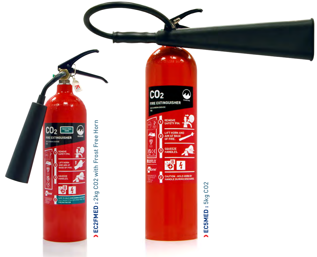
› EC2FMED : 2kg CO2 with Frost Free Horn