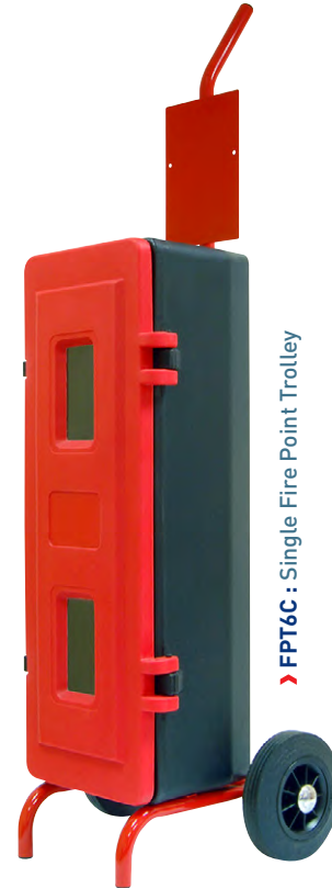
➤ FPT6C : Single Fire Point Trolley